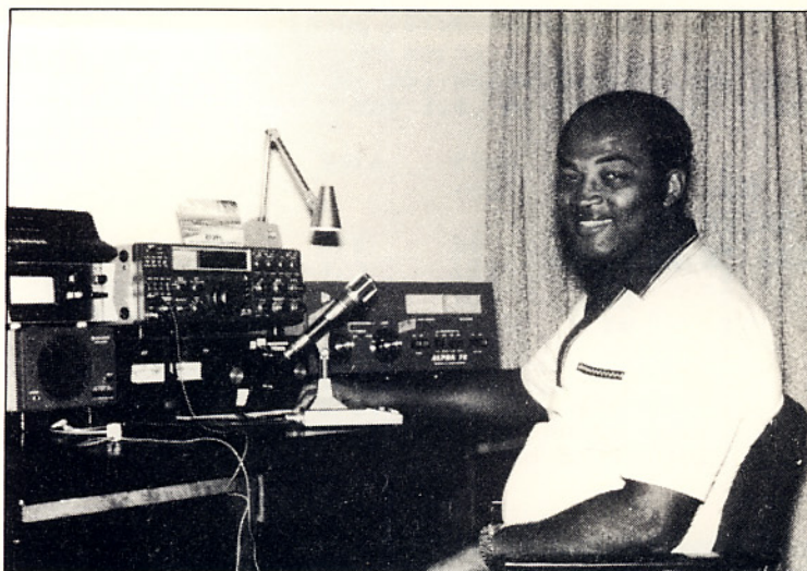
"Doc," ZF1MA (this is where N6RJ/ZF2FL contests from)